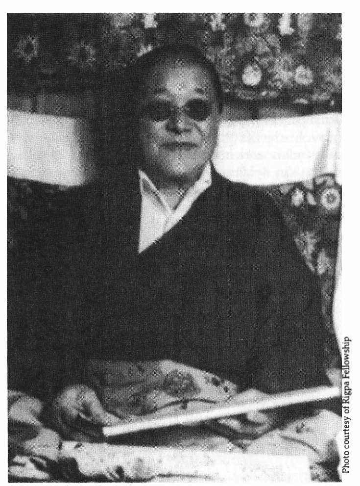
Kyabjé Dudjom Rinpoche