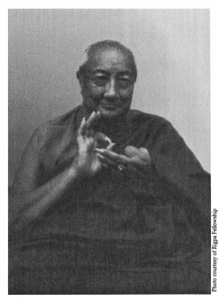
Kyabjé Dilgo Khyentse Rinpoche