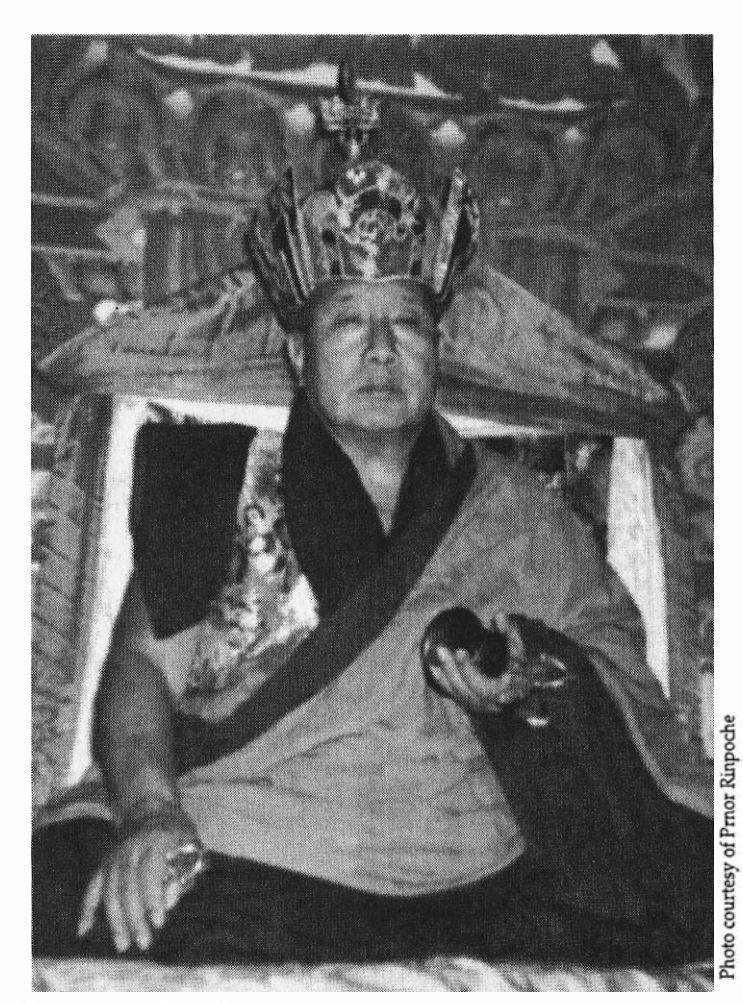
Kyabjé Penor Rinpoche