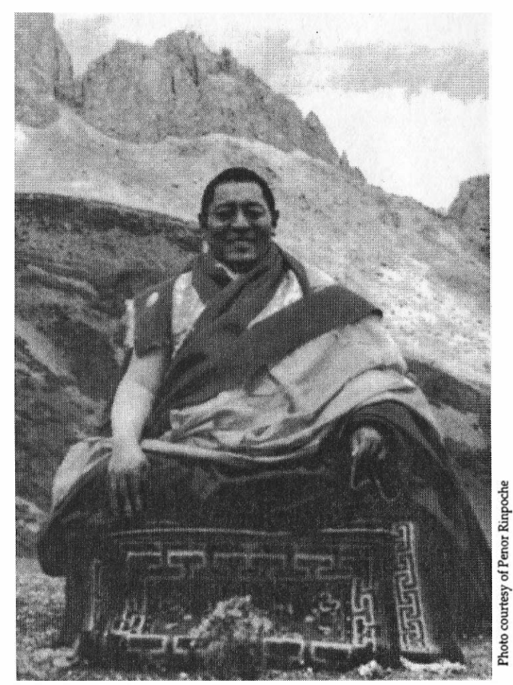
Kyabjé Khenpo Jigmey Rinpoche